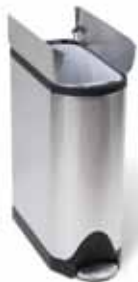
butterfly step can