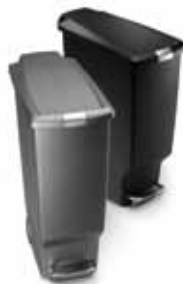
slim plastic step can