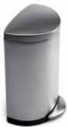
semi-round step can